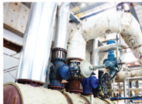
High Pressure Steam Header