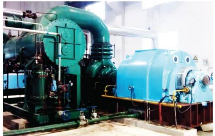
4500KW Extraction Condensing Turbine/Generator Boiler: 35ton 25bar 400°C Extraction for Process 15ton at 6 - 8bar