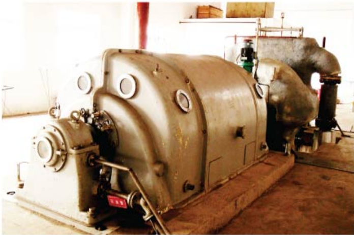
1800-2000KW Back Pressure Turbine/Generator Boiler: 35ton 25bar 400 °C | Back Pressure for Process 35ton at 6 - 8bar