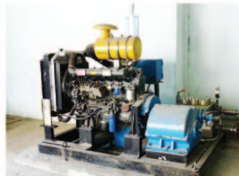
Diesel Engine Operated Emergency Pump