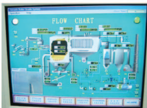
PLC with SCADA