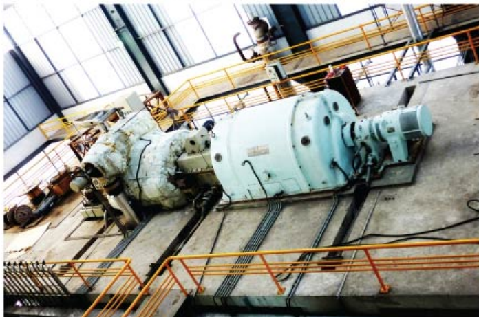
AKPC Asia Kraft Papermill(Thailand) Boiler: 75ton 100bar 540°C CFB Boiler | 9.9MW Back Pressure Turbine/Generator | Installed in 2013 by Hamada Boiler