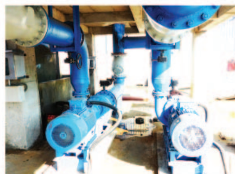
Cooling Tower Circulating Pump