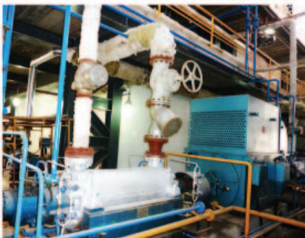
High Pressure Feed Water Pump