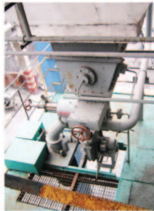
Automatic Ash Disposal Valve