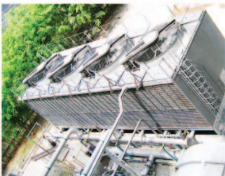
Cooling Tower for Condensate water