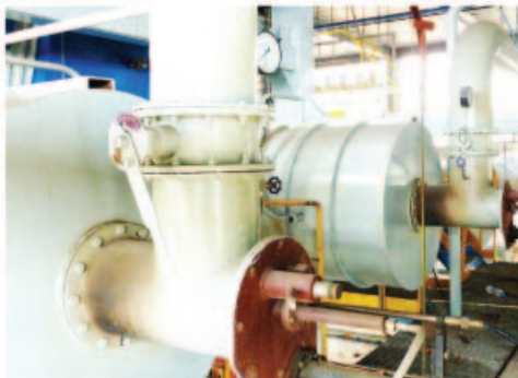
Ash Cooler System