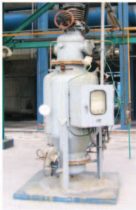
Pneumatic Ash Pump