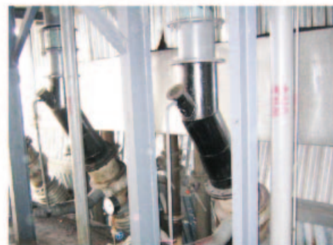
Coal Feeding System with Injection of Air