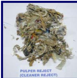
.....(4 kinds of waste from paper factories).....