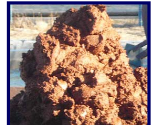
Wastewater treatment waste