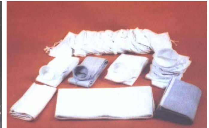
TFM04-5(B) P84/PTFE+Fiber Glass Coating