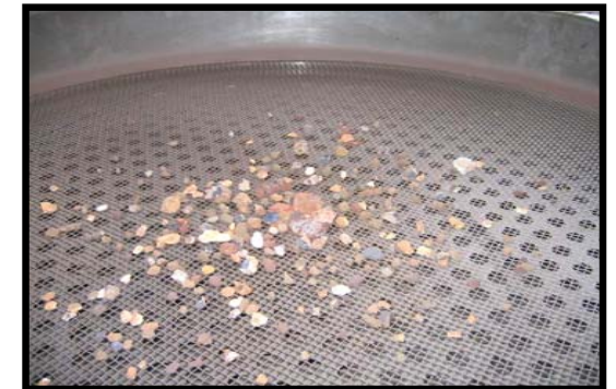
Foreign materials and stones are separated by this screen vibrator