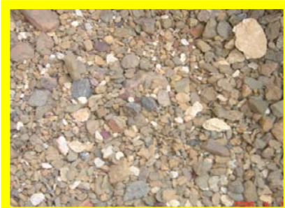
Clean sand for return to the furnace